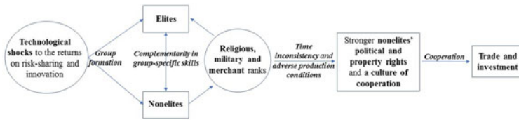
Figure 1. Testable implications of the theoretical framework. Note: The main ingredients of the theoretical framework are given in bold.

period, religious ranks during the proto- and city-states periods and the temples and palaces during the kingdoms and empires periods, whereas the role of the former was covered by the temples during the urban revolution period, military ranks during the city-states period and merchants during the empires period (Sallaberger, 2019). On the other hand, shocks reducing the returns on joint investments forced the elites to grant to the nonelites strong political and property rights to credibly favor the exchange between their – culture of – cooperation in investment and public good provision.