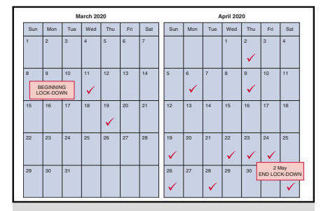
Incidence of type A acute aortic dissection in Bologna during the Italian lockdown.

Bologna University's Institutional Review Board determined that this study is exempt from institutional review board submission although all patients (and/or relatives) gave us consent to use personal information. It was also conducted in accordance with the ethical principles established in the Declaration of Helsinki.