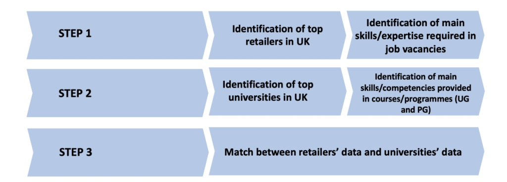
Figure 3: Research pipeline