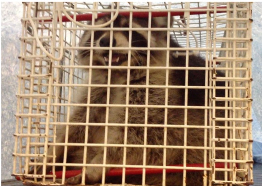
Figure 1. A wild raccoon placed into the squeeze cage to receive the intramuscular (IM) injection of the anesthetic mixture before gonadectomy.

Twenty-four hours before the procedure, the animals were hospitalized at the VTH. Food and water were withheld for 12 h before surgery. On the day of surgery, the raccoons were weighed with a digital platform scale. Animals were identified as either juvenile or adult based on presence of external genitalia, body mass and teeth consumption [18]. The RANDBETWEEN function of Excel was used for allocation of animals into two groups to receive one of the following drugs combinations intramuscularly (IM): 7 mg/kg ketamine (Ketavet 100 ® , MSD Animal Health S.r.l., Segrate, MI, Italy) with either 7 µg/kg dexmedetomidine (Dexdomitor, 0.5 mg/mL, Elanco Animal Health, Eli Lilly Italia S.p.A., Sesto Fiorentino, FI, Italy) (KD group), or 0.3 mg/kg midazolam (Midazolam I.B.I., 0.5% ® , Aprilia, LT, Italy) (KM group). All drugs were mixed in the same syringe and injected in the triceps muscle with the animal in a containment cage equipped with a squeeze chute (Figure 1).