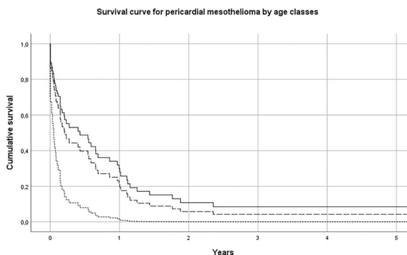
Figure 1a. Survival curve by age-class for pericardial mesothelioma. Italy, 1993–2015 (N=58). [Age classes: ≤64 years = solid line; 65–74 years = long dashed line; ≥75 years = short dashed line.]

1b). Asbestos exposure has been assessed for 113 out of 138 (81.9%) MM cases included in this study, after a direct (56/113=49.6%) or indirect (to a next of kin) interview (57/113=50.5%) (table 1). Occupational exposure to asbestos (definite, probable or possible) was present for 61.9% of interviewed subjects (70/113), with differences by gender and site (23.6% in females pericardial MM, 75.0% in males pericardial MM and 66.2% in TVT MM). The economic sectors more frequently associated with asbestos exposure were construction, steel mills, metal-working industry, textile industry and agriculture. Asbestos exposure in this last sector in Italy has been previously described in ReNaM reports, due mainly to the maintenance of rural buildings containing asbestos.