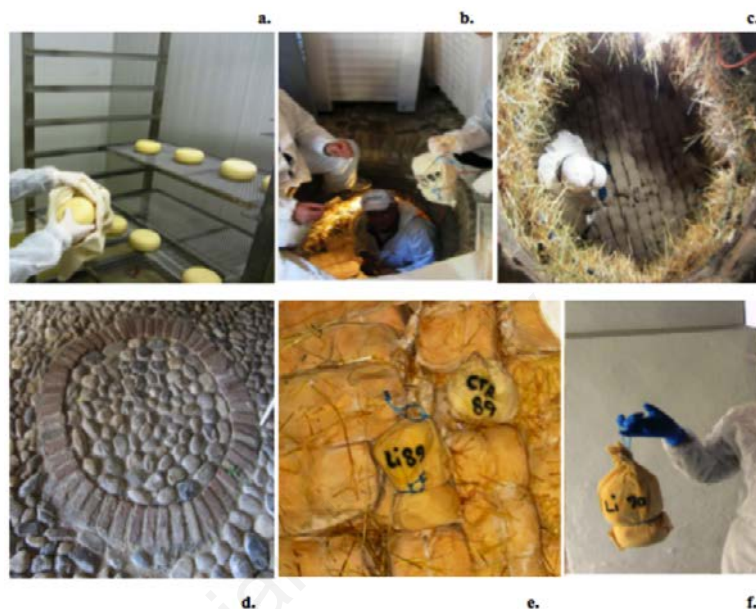
Figure 2. Images showing the cheeses during the ripening in room and into pit performed during the challenge test, according to the specifications of Formaggio di Fossa di Sogliano PDO cheeses. a) after the ripening in room, the cheese wheels were wrapped in natural cotton bags for the ripening into pit; b and c) the pit was filled with the inoculated cheeses; d) the pit was hermetically sealed; e) the pit was opened after 93 ripening days; f) the Formaggio di Fossa di Sogliano PDO cheeses, items of the challenge test, were transported to the laboratory for analyses.

samples were first transferred separately into plastic one-chamber filter stomacher bags (NEOMED, Milan, Italy) and then homogenized for 3 min in a Stomacher 400 blender (Seward Medical, London, UK) with 225 mL of 0.1% w/v of Buffered Peptone Water (BPW) (containing 1% v/v of Tween