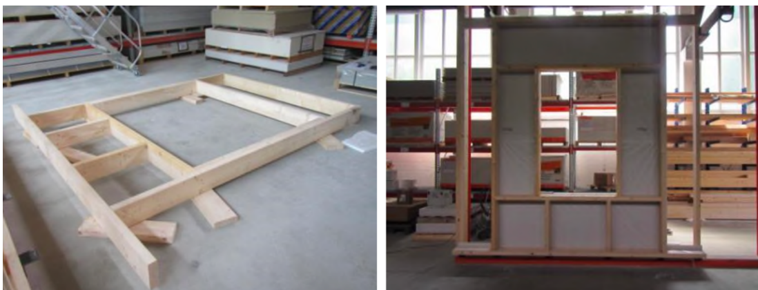
Figure 2. Example of PnP building component: multifunctional façade panel constructed by Fermacell