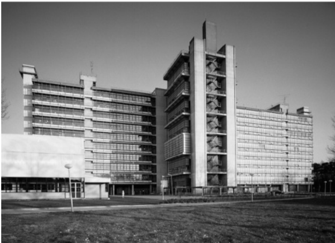
Figure 3. Enschede (NL) demonstration cases. Transformation of university building to student hostel in Enschede, the Netherlands