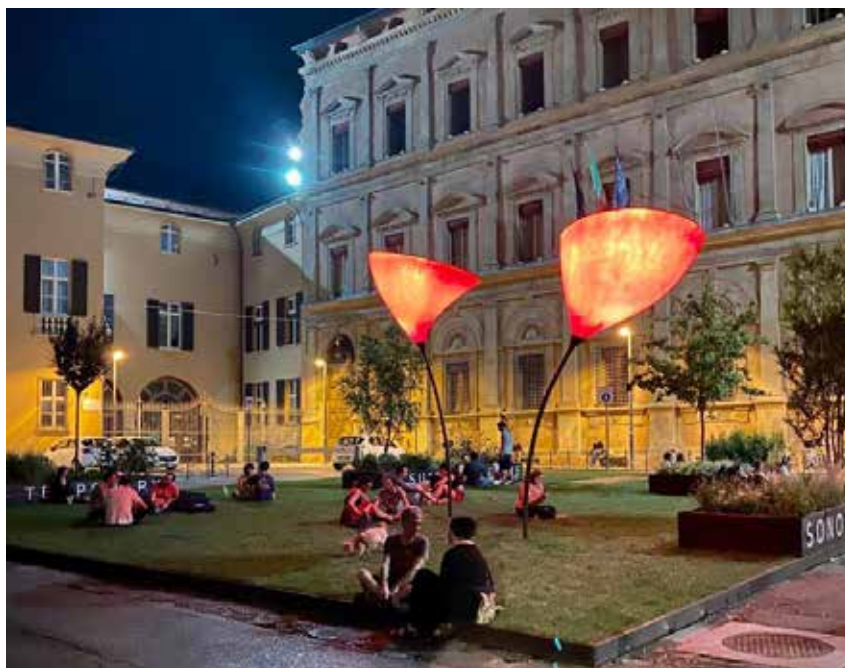
Figure 7: The “Green Please 2.0” project by night, July 2020.