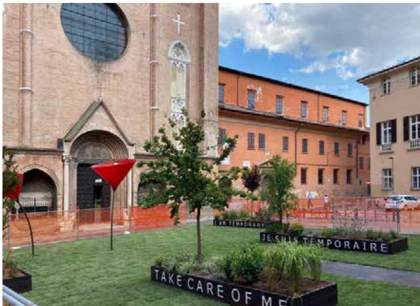
Figure 6: The “Green Please 2.0” installation completed, June 2020.