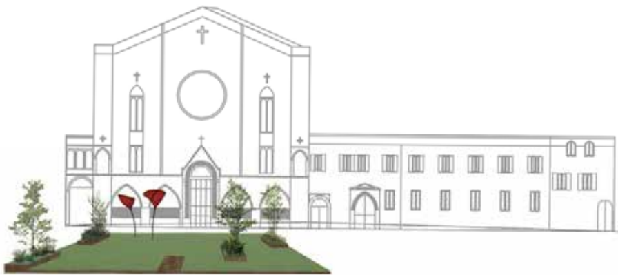
Figure 3: Concept of the second temporary project “Green Please 2.0! the green you don't expect”.

The temporary urban installation is basically a new meadow, bounded by a wooden edge 15 cm high, which contains the soil substrate. A ramp makes it accessible for all, overcoming the small height difference (Fig. 3). The vegetable footboard is partially occupied by planters that house small ecosystem of plants, in line with other experimental actions of urban green injection within the historical university area developed by the ROCK project: the temporary installation “Malerbe” (Piazza Scaravilli, 2017–2019) [22] and the pocket garden “U-Garden” (Terrace of the Municipal Theatre in Piazza Verdi, summer 2019) [23] (Fig. 4).