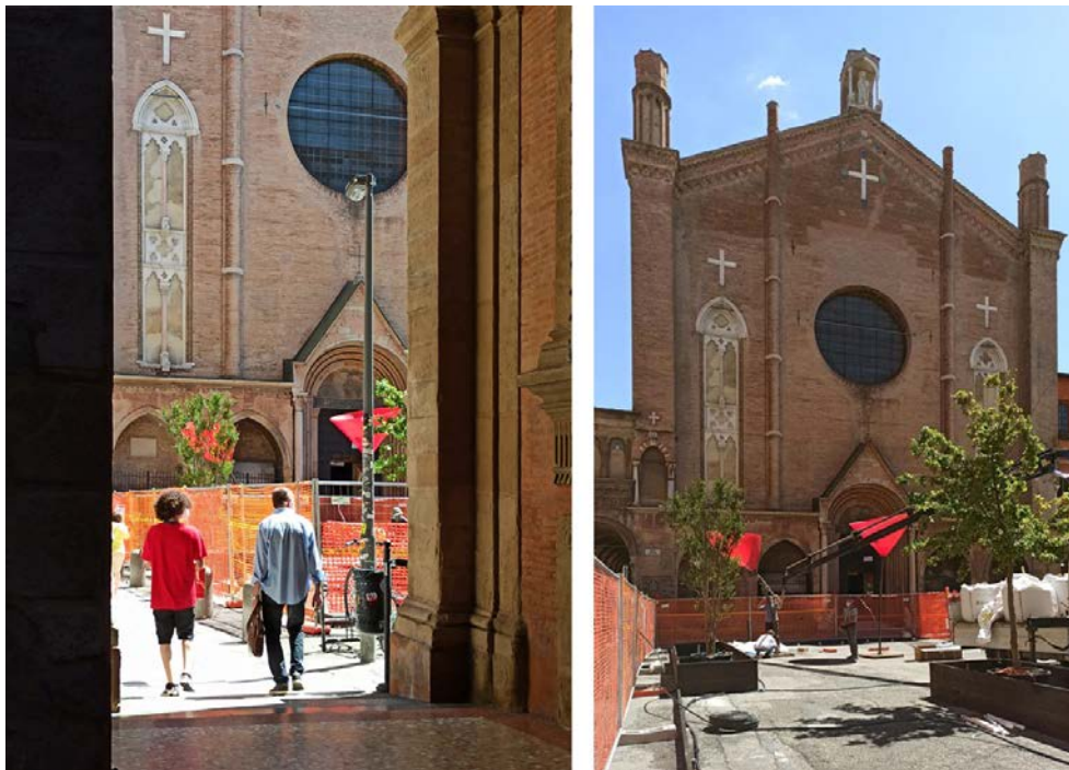
Figure 5: The “Green Please 2.0” project under construction, June 2020.

The installation was open to the public from the beginning of July 2020 and the Municipality of Bologna, in collaboration with FIU, promoted a series of open and cultural activities to be carried out on the lawn of Piazza Rossini – “Take care of U. Encounters and stories on the meadow” – as part of the summer activities of “Bologna Estate”. Taking advantage of this rediscovered space, the initiative is fostering a sense of appropriation, responsibility and care for CH and common public spaces (Figs 5–7).