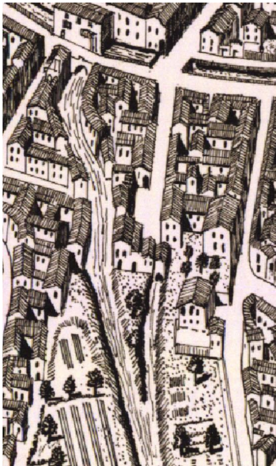
Figure 1. A portion of the map by Filippo de' Gnudi (1702), where bare channels in the city are clearly visible.