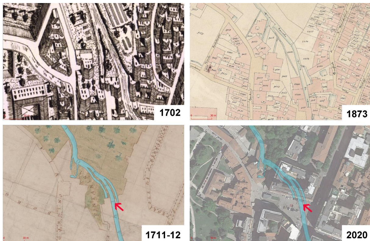
Figure 4. Screenshots from the HGIS inherent a portion of city in four different years. In 1711-12 and 2020 the vectorization is superimposed to the maps for comparison: the channel mapped in 1711-12 (blue) and the viewpoint of the ancient drawing of Figure 3 (red arrow).