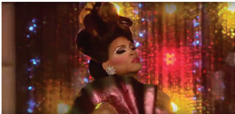
Video 4. Italian promo on Fox Life (2013).

If the expectations were not high in the first place, America's Next Drag Queen had even lower results. The show gained some press recognition, with articles presenting it as “the craziest show of the year”, 9 but failed to find an Italian audience. Not only were the first two seasons not caught up, but also the linear broadcast was discontinued after these three years, creating then a long pause in the national (legal) availability of the show for its most loyal fans. Only a few months after the official launch of Netflix in Italy (on October 22, 2015), 10 and exactly in February 2016, a new Italian window for RPDR finally opened. As a part of a larger, global deal (outside the US), the series was released in all its seasons, except the first one, and made available in its English-language version, with Italian subtitles; starting from season eight, an Italian dubbed version, with simil-synch techniques, was added too.