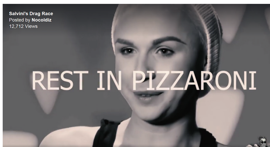
Video 11. Salvini's Drag Race ironic video.