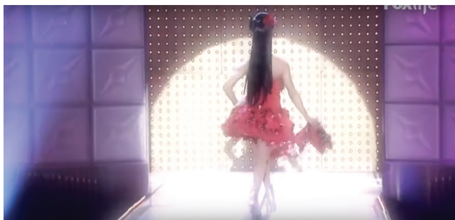
Video 2. Italian promo on Fox Life (2011).