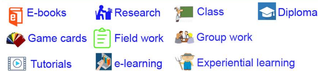
Figure 1. Regional distribution and educational tools adopted in the projects presented in this study.