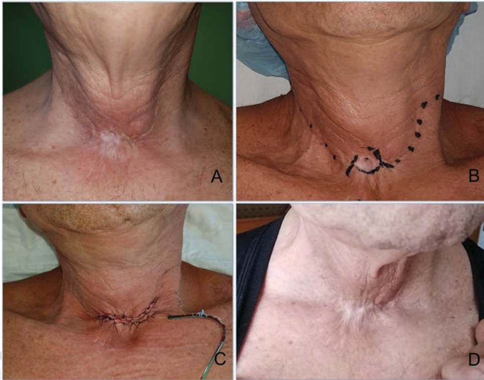
Fig. 2 (A) recurrent tracheocutaneous fistula after subtotal laryngectomy, radiotherapy and right neck dissection, and multiple closure attempts. (B) Preoperative markings: planned scarred skin excision around the fistula. Marked dots over previous neck surgical scars. (C) Immediate postoperative result. (D) Result at 20 months follow-up: excellent functional result without complications and a satisfied patient

the skin, also provides easy access to the trachea and the sternal and clavicular insertions of sternocleidomastoid muscles.