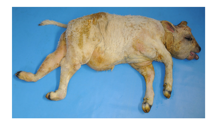
FIGURE 1 Stillborn Marchigiana calf showing multiple congenital anomalies. Note the shortened face and distended ventral abdomen resembling paunch calf syndrome reported in Romagnola cattle. Note the swollen hind legs and the right fetlock externally rotated

The affected calf had an enlarged head caused by a SC swelling that was especially evident in the periocular and the submandibular regions. The splanchnocranium was shortened and the frontal region asymmetric. The tongue was swollen and protruded from the mouth. The eyes were enlarged with evident scleral injection and conjunctival