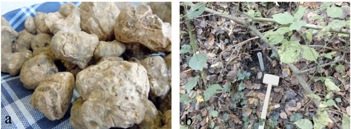
Fig. 1 – Ascomata of T. magnatum (a), soil sampling (b).

10 mM of each primer (0.8 ml), water (16.7 ml), Red Taq 1 U (Sigma) (1.2 mL) and DNA template (1 ml of the first PCR product). PCR reactions were performed with the following conditions: 6 min at 94 °C followed by 34 cycles of denaturation at 94 °C for 30 s, annealing at 50 °C for 30 s, extension at 72 °C for 30 s and a final extension at 72 °C for 5 min.