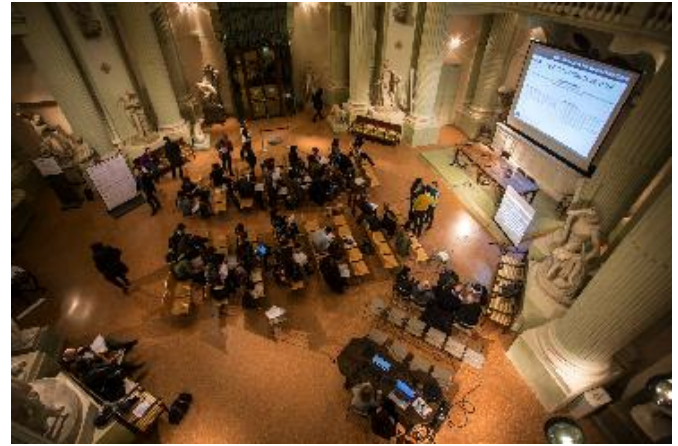
Figure 2. ROCK U-lab activities of listening and co-designing.

The first phase began with the involvement of local actors (institutional and non-institutional) to be involved in the definition of laboratory activities and in the implementation of actions. The experimentation phase has seen the materialization of the defined actions, developed through co-construction workshops of temporary spatial arrangements and a call for ideas, through a series of events and activities carried out during the summer season, by the actors previously involved, in this phase, becoming agents of the transformation of the portion of the city.