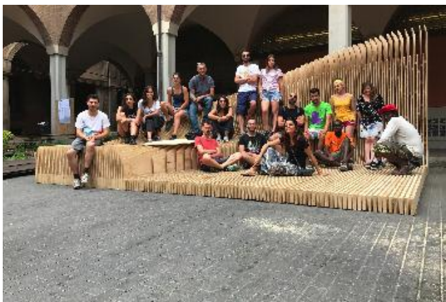
Figure 3. ROCK explores the possibility of directly involving citizens in transformation processes, allowing the exchange of value and knowledge within social ecosystems. The construction of SLAB, 6 July 2018.

Parallel to the living lab sessions, another intervention strategy has been elaborated for the reclamation and the activation of underused and scarcely accessible spaces in the University district. This approach was directed towards light and reversible interventions. Beyond the strategy of urban regeneration through cultural events, ROCK had the initial aim to construct communities able to think, design, realize and take care of interventions in the long term. For this reason, the design of ROCK's transformations took place during co-design workshops with inhabitants, students from various backgrounds, as well as local practitioners and designers. Whenever possible, the actual interventions are realised through simple techniques that allow a direct involvement of unskilled individuals in the construction site. In this way, co-design, self-building and collective management become key moment for the construction of a community of intents and practices able to take care of the university area and its public spaces.