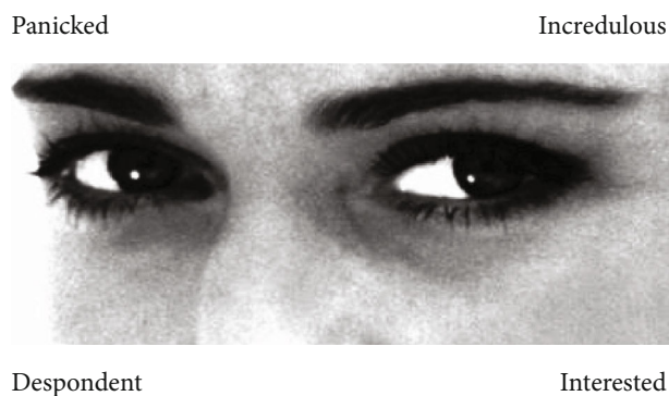
FIGURE 1: Example of one of the 36 photos of the Eyes test.