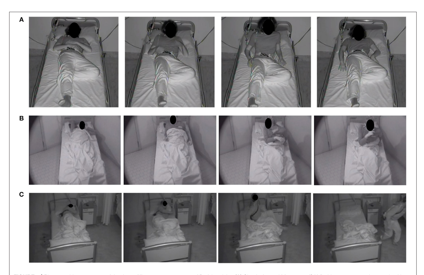
FIGURE 1 | Photographic sequences of the three different motor patterns of DoA in adults. (A) Simple Arousal Movement (SAM): this pattern was characterized by head flexion and/or head extension and/or limb movement; (B) Rising Arousal Movement (RAM): the core feature of this pattern was a trunk flexion followed by sitting with feet in or out of the bed; (C) Complex Arousal with ambulatory Movements (CAM): this pattern was characterized by sitting up, getting out of bed, and walking.

Once awake, the majority of patients reported that they felt confused and disorientated, and more than half of patients could not recollect the episode. Approximately one-third had complete amnesia. This raises fundamental questions about the medico-legal and forensic implications of DoA, given the neurophysiologic and cognitive states that characterize patients during such episodes (34).