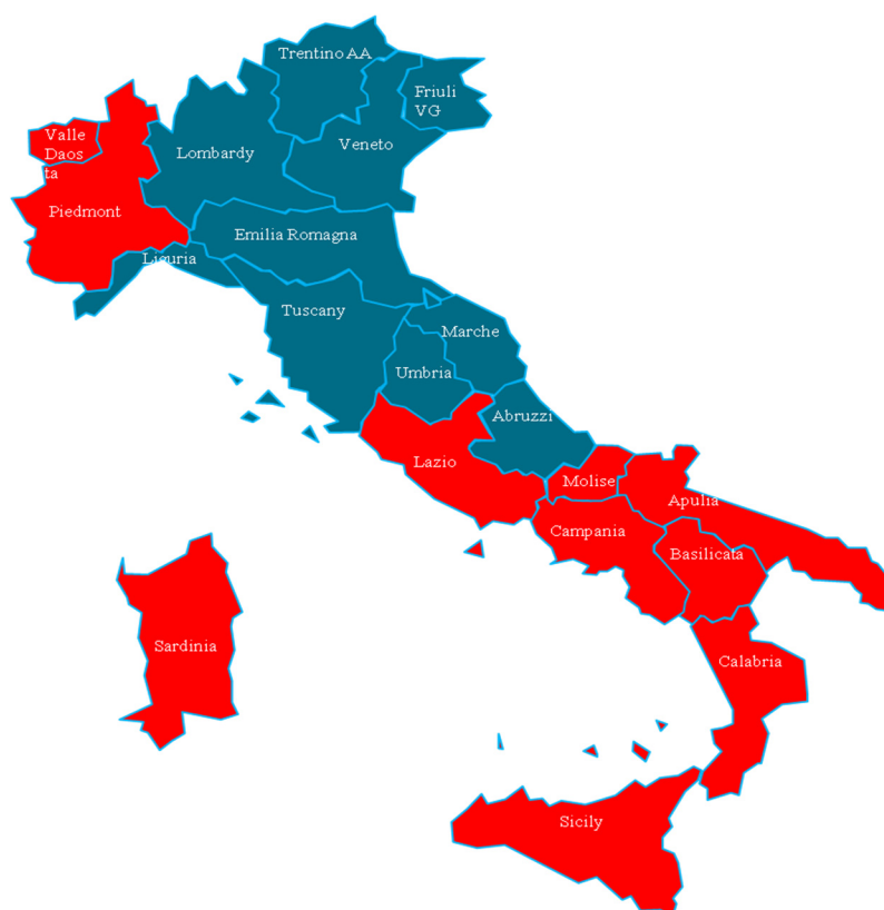
Figure 1. Total debt ratio under and above the national average.

Figure 1 shows a map of Italy in which the regions whose average ratio of total debt is under the national average (in red). This map highlights the marked difference in the use of debt between the north and the south of Italy.