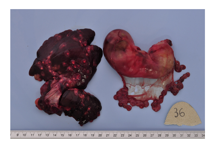
Fig. 1. Hare 36/2013, liver and stomach. Cysticercosis ( T. pisiformis ) in liver surface and gastric peritoneum.

A pattern typical of epidemic infections, characterized by