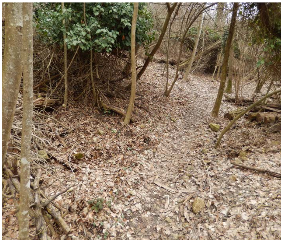
Fig. 1. Area of the SCI IT4050016 "Abbazia di Monteveglio" Regional Park (Emilia Romagna Region, Italy) where D. crocea was found. On the left side there are young oaks which are not visible in the picture.

The ascoma of D. crocea was found in the SCI IT4050016 "Abbazia di Monteveglio" Regional Park (Emilia-Romagna Region, Italy) near the zone A (coordinates 44° 17' 56.88" N, 11° 05' 9.9599" E) the 28 November 2014, and deposited in the Herbarium CMI-Unibo (herbarium n. 4518). The habitat type is 92A0 ( Salix alba and Populus alba galleries) along the Ramato stream. The ascoma was found near plants of the footpath, in proximity of young plants of Quercus pubescens Willd. (Fig. 1).