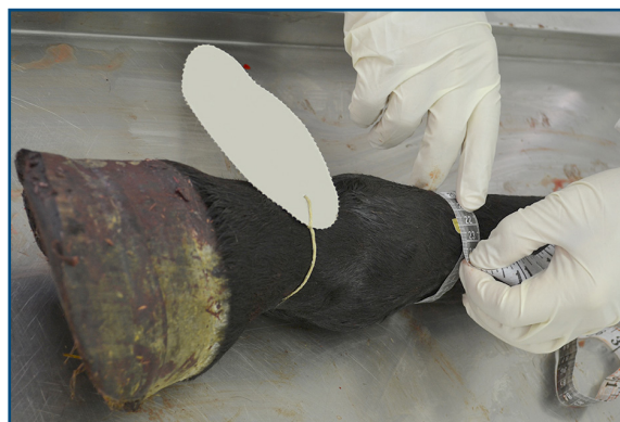
Figure 2. Shin circumference measurement of the isolated limb five hours after death. Sample 1b.