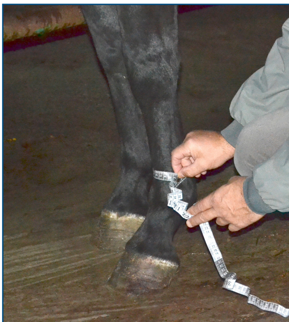
Figure 1. Shin circumference measurement in the living horse. The measurement was performed right above the fetlock joint. Sample 1b.

The aim of this study is to evaluate the conformity between the measurement of the shin circumference in the living animal and in post-mortem examination in order to assess its forensic soundness.