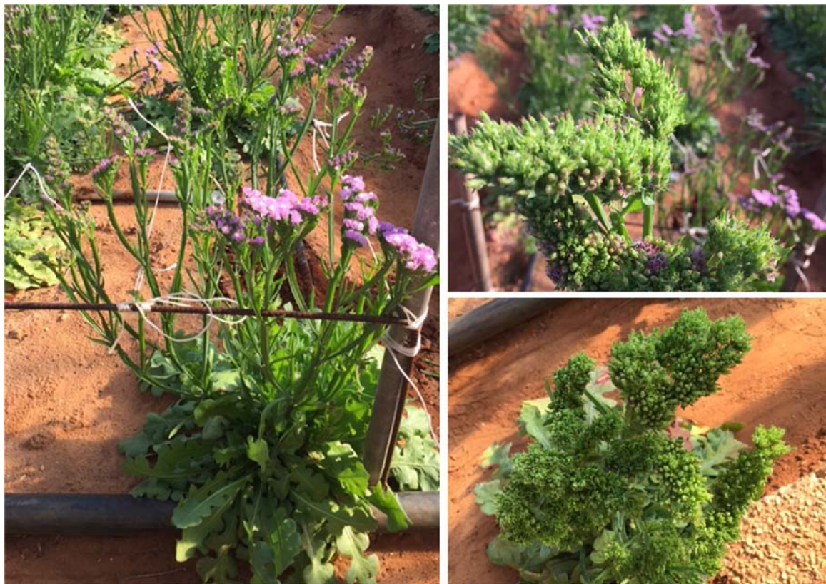
Figure 1. L. sinuatum plants in greenhouse showing symptoms of lack of flower, stunting and malformation due to the presence of aster yellows phytoplasmas (16SrI-B).

Samples from different ornamental plant species showing symptoms indicating phytoplasma presence were collected between 1993 and 2016 in various floricultural areas in north and south Italy. In particular, the 23 phytoplasma strains employed were from hydrangea ( Hydrangea macrophylla L.) (5), Primula spp. (3), Centaurea erythraea (2), Petunia spp. (2) and gerbera ( Gerbera jamesonii L.) (1) samples showing flower virescence; from Gladiolus spp. samples both in vivo and in micropropagation (2) showing the “germs fins” symptomatology; from statice ( Limonium sinuatum L.) (2) with stunting and lack of flower production collected in a greenhouse located in Sicily (Southern Italy) (Figure 1); from Ranunculus asiaticus L. (2) and carnation ( Dianthus barbatus L.) (4) with virescence and flower malformation.