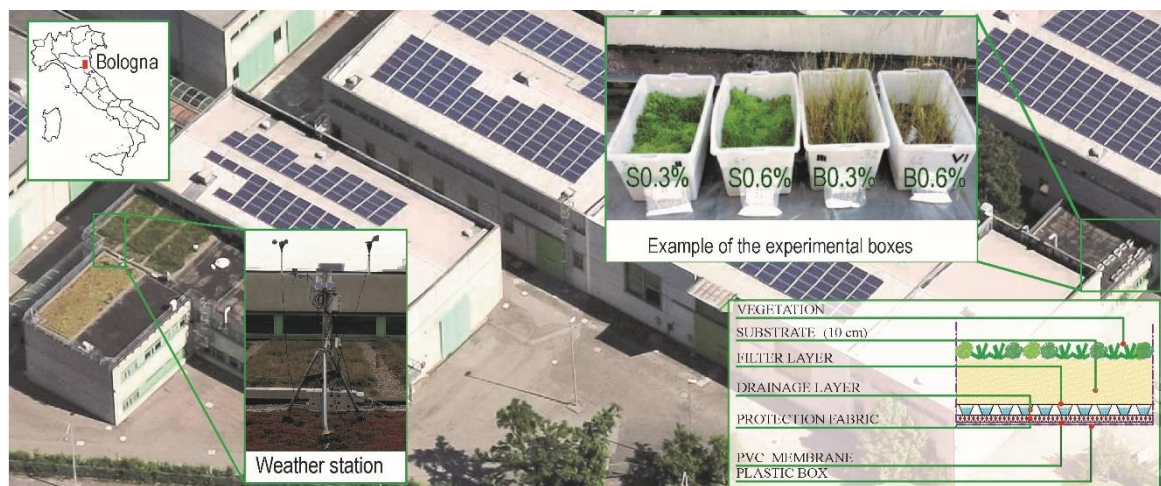
Figure 1. Aerial view of the experimental site showing: the location of the experimental test boxes, the position of the weather station and the stratigraphy of the green roof.