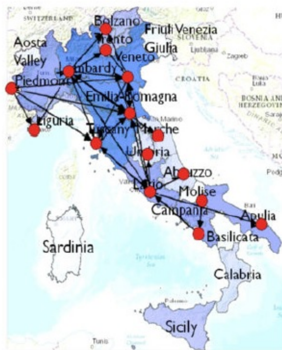
Fig.1: Interregional tourism flows across Italian regions (year 2012). To simplify the structure, links smaller than 300000 units are not displayed.

As regards domestic tourism shares of Italian regions (Italy = 100), they do not show substantial changes in 2015 with respect to 2007 (Table 5). However it is worth noting that nine regions maintained the same position in the ranking (Emilia-Romagna, Veneto, Tuscany, Trentino, Lombardy at the top, Sicily in the middle, and Molise, Basilicata, Aosta Valley at the bottom), four regions improved their own position (Umbria, Piedmont, Apulia, Lazio), while the remaining seven regions dropped down in the rank order. In this scenario, it is fundamental to address some issues: what can regions do to compete and increase, or at least preserve, their relative market shares? What can regions do to pursue strategies for tourism development that enable them to achieve economic and social goals? These are important questions for any tourism destination today.