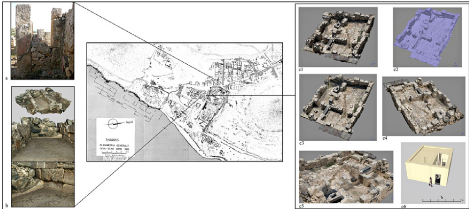
Fig. 4 – Archaeological map of Tharros (PESCE 1966, Planimetria generale degli scavi anno 1965) with the contexts involved in 3D relief by laser scanner and photogrammetric method: a) Eastern wall of building no. 20 (photo by M. Marano); b) 3D model of building no. 58 (MARANO, SILANI in press); c) Point cloud (c1), mesh (c2), NW view of 3D model (c3), SW view of 3D model (c4), SE detail view of 3D model (c5) and reconstruction of the first phase (c6) of building no. 56. Data acquisition and processing: M. Marano.

In the processing phase, the first step has been a specific analysis of the acquired images filtering the 3D point cloud in order to delete the noise elements caused by earth layer and vegetation in the site. The point cloud (Fig. 4, c1) was obtained through the alignment by homologous points, coloured and decimated for modelling process in order to achieve the final 3D texturing restitution (Fig. 4, c3-5).