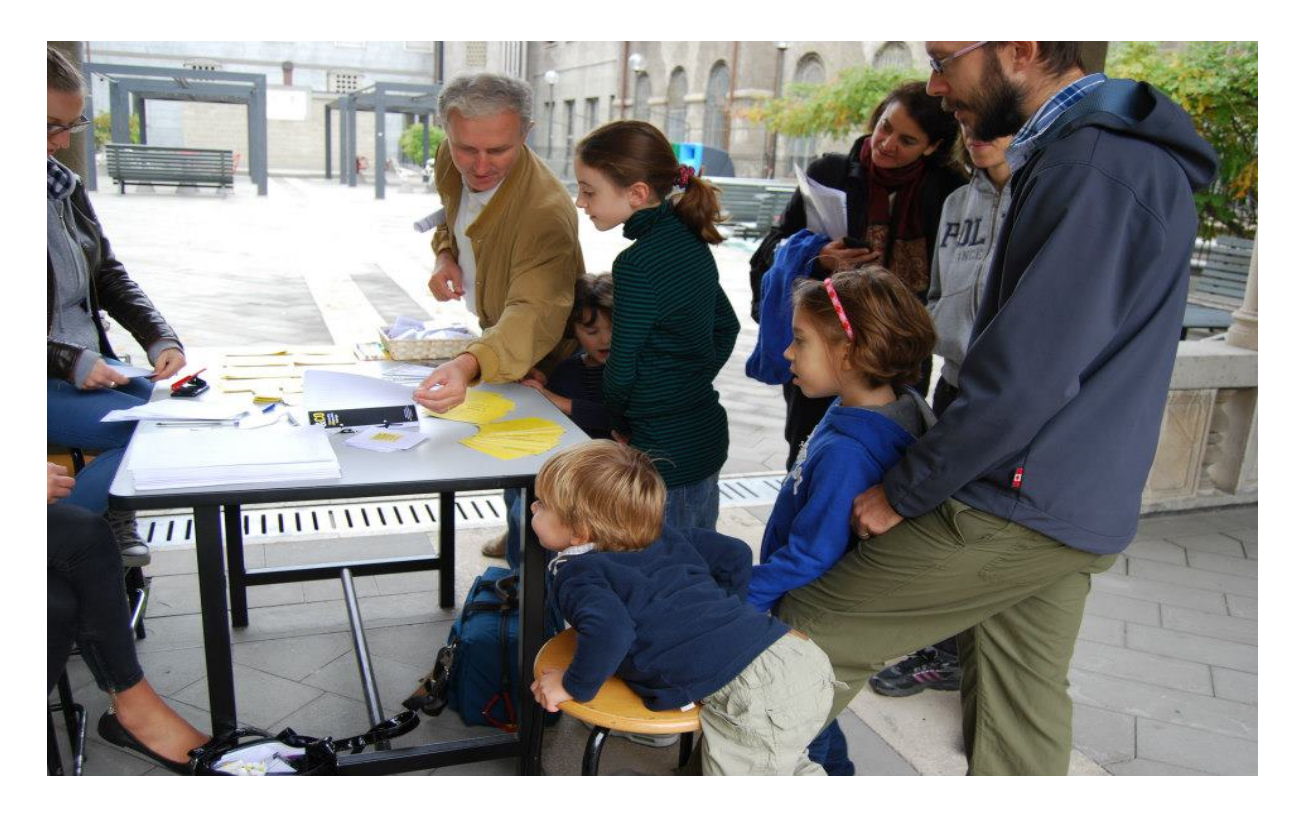
Figure 2. Interviews with Quarto Oggiaro Neighbours

Within the context of the European project My Neighbourhood a long term experiment of SI design has been conducted by a team of design researchers. The Milano pilot experiment has taken place in the Quarto Oggiaro neighbourhood, located in the northwest area of Milano, not far from where the 2015 Expo has been located. Here the entire SI design process has been conducted thanks to a strong collaboration between the Politecnico di Milano (holding a long tradition in design and in urban planning research) the Municipality of Milano, the associations and volunteers that operates in this area, the people who leave there. This mixed design team performed all the activities in the context and managed the interactions with the local communities and stakeholders to engage them in the co-design process and in the SI experimentation. The pilot has been conducted for 1 year and half. The First months have been dedicated to exploring and approaching the neighbourhood.