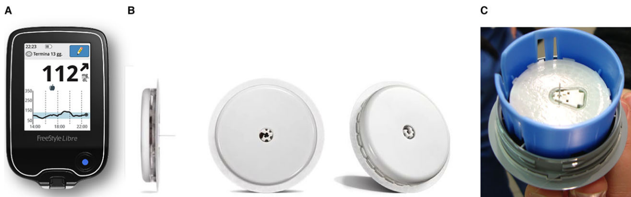
Fig 1. FreeStyle Libre FGMS is composed of the following: (A) the reader that in one-second shows the glucose reading; (B) the sensor that with a small catheter measures the interstitial blood glucose in the subcutaneous tissue; and (C) the sensor is applied on the skin by the provided applicator.

During the wearing period of the sensor, each dog was evaluated for 3-time periods as follows: from the 1st to 2nd day, from the 6 to 7th, and from the 13 to 14th day. During every evaluation period, that lasts 36 hours, blood samples were collected simultaneously every 2–3 hours from cephalic intravenous catheter previously placed. Mean (SD) number of samples, obtained during the 1st–2nd, 6–7th, 13–14th were 16.5 (12.4), 17.8 (6.5), and 16.6 (4.0) respectively.