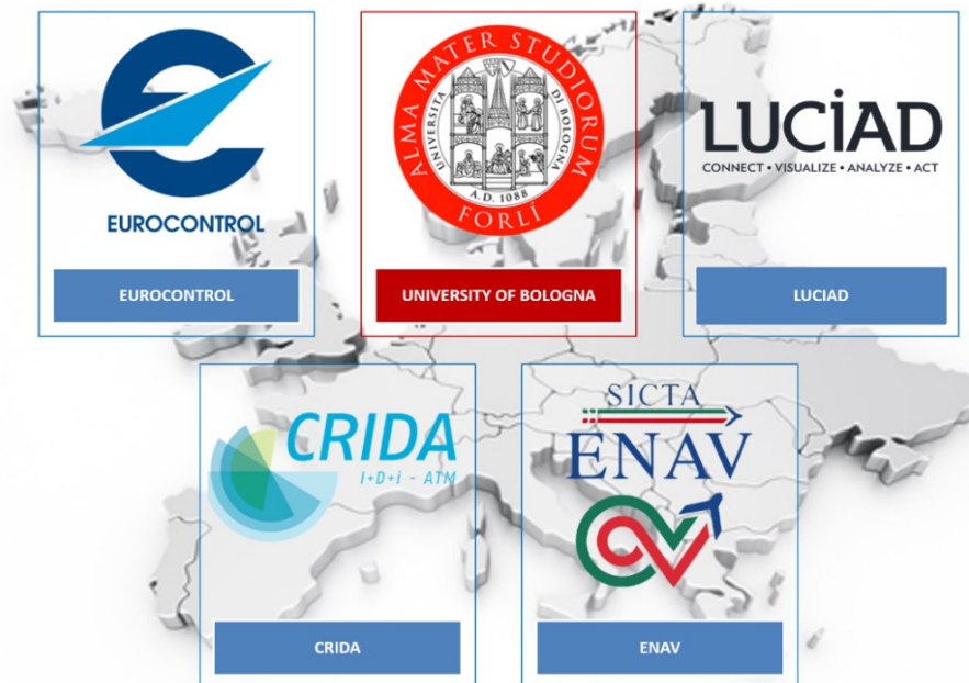
Fig. 1. The RETINA project consortium.

The Resilient Synthetic Vision for Advanced Control Tower Air Navigation Service Provision (RETINA) project is one of the selected Single European Sky ATM Research (SESAR) projects on High Performing Airport Operations that will investigate the potential and applicability of Virtual/Augmented Reality (V/AR) technologies for the provision of Air Traffic Control (ATC) service by the airport control tower. The project will assess whether those concepts that stand behind tools such as Head-Mounted Displays (HUDs), Enhanced Vision Systems (EVSs) and Synthetic Vision Systems (SVS) can be transferred to ATC with relatively low effort and substantial benefits for controllers' Situational Awareness (SA). In doing so, the project Consortium (Fig. 1) will investigate two different augmented reality systems: Conformal-Head-Up Displays (CHUDs) – which, potentially, can be made to coincide with the tower windows – and See-Through Head-Mounted Displays (ST-HMD). This will be done by means of out-of-the-shelf AR hardware components. A dissimilar third tool, i.e. a virtual reality based Table-Top interface, will be conceived as well, since the upper view is the easiest way to visualize the airport digital model (Fig. 2).