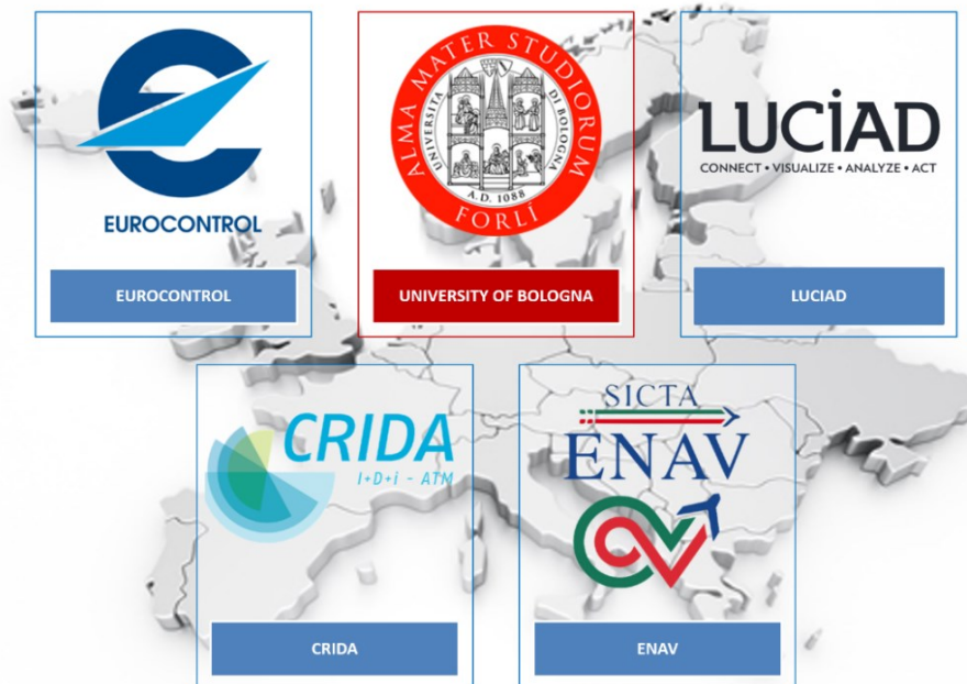
Fig. 1. The RETINA project consortium.

The Resilient Synthetic Vision for Advanced Control Tower Air Navigation Service Provision (RETINA) project is one of the selected Single European Sky ATM Research (SESAR) projects on High Performing Airport Operations that will investigate the potential and applicability of Virtual/Augmented Reality (V/AR) technologies for the provision of Air Traffic Control (ATC) service by the airport control tower. The project will assess whether those concepts that stand behind tools such as Head-Mounted Displays (HUDs), Enhanced Vision Systems (EVSs) and Synthetic Vision Systems (SVS) can be transferred to ATC with relatively low effort and substantial benefits for controllers' Situational Awareness (SA). In doing so, the project Consortium (Fig. 1) will investigate two different augmented reality systems: Conformal-Head-Up Displays (C-HUDs) – which, potentially, can be made to coincide with the tower windows – and See-Through Head-Mounted Displays (ST-HMD). This will be done by means of out-of-the-shelf AR hardware components. A dissimilar third tool, i.e. a virtual reality based Table-Top interface, will be conceived as well, since the upper view is the easiest way to visualize the airport digital model (Fig. 2).