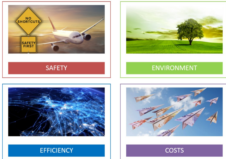
Fig. 4. Areas of interest impacted by the RETINA concept.

Definitely, the RETINA concept could highly contribute to establish a satisfactory level of safety for smaller airports, where traffic volume is simply too low to pay back for the initial investment in a SMR equipment. Side effects, such as the increase of traffic volume at smaller or peripheral airports due to a better level of quality of service must not be neglected. Passengers and couriers could use small aircrafts on a more frequent basis, with positive social impact on the community living in the airport surrounding. Consequently, the number of operations would increase and more airport equipage may be needed.