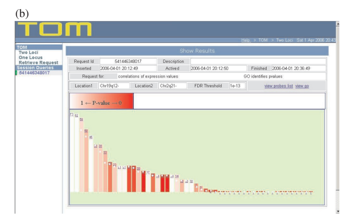
Figure 2. (a) It shows an example of Results page for familial Breast Cancer, highlighting the known relationship between BRCA1 and JAK1. The Results table can scroll and more information, such as correlation values, then become visible. (b) It shows the graphical output of the functional analysis of Two Loci problem, namely Thyroid Cancer. This allows a rapid overview of the results. Every GO category of the candidate genes is represented in the bar graph. Categories are sorted based on the number of hits (height of the bar) and the P -value information is carried by a white to red shade of color. Tall white bars represent the best candidates, small red ones the worse.

and PKD2, T0MM70A and TIMM17A, ANNXA11 and PP1F.