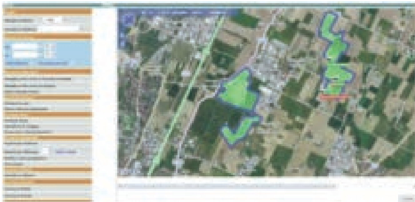
Figure 2. Website overview, mapped areas and tractors monitored during operations.