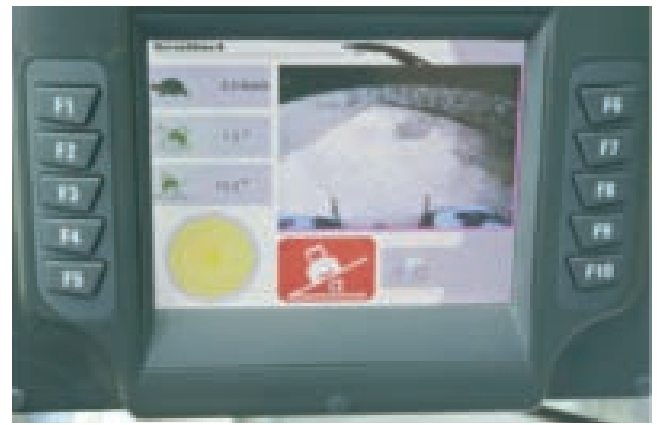
Figure 4. Multisensor display device during the static test.