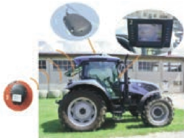
Figure 1. Tractor fitted with multisensor device, main controller (1), visual warning display (2), implement transceiver (3).

Preliminary and methodological aspects of the research are described, providing information on the architecture of the device, tractor field testing and data collection.