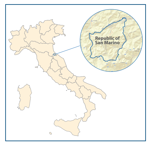
Figure 1. Localization of the Republic of San Marino within the Italian territory.

The Republic of San Marino (43° 46' N, 12° 25' E) is located in the middle of Italy and borders with Rimini and Pesaro-Urbino provinces, respectively in the Emilia-Romagna and Marche regions (Figure 1). The land covers an area of 61,196 km<sup>2</sup>, mostly hilly and clayey. The climate is continental, with hot summers and cold winters and heavy snowfalls. The summer mean temperatures range between 20°C and 30°C, with peaks of 35°C, the winter temperatures range between -5°C and 10°C. The kennel is sited in a hilly area used for the intensive cultivations of wheat, grapevine and orchard, surrounded by rich vegetation.