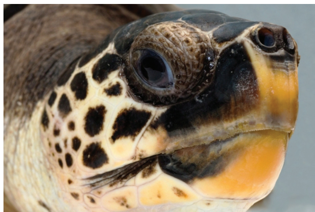
Fig. 2: Detail of the shape and coloration of the head.