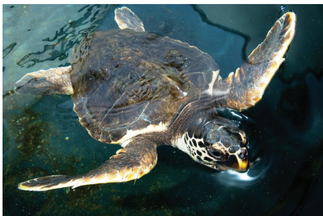
Fig. 1: Picture of Matilde in the rescue center “Centro Regionale Recupero Fauna Selvatica e Tartarughe Marine” (Comiso, Ragusa).