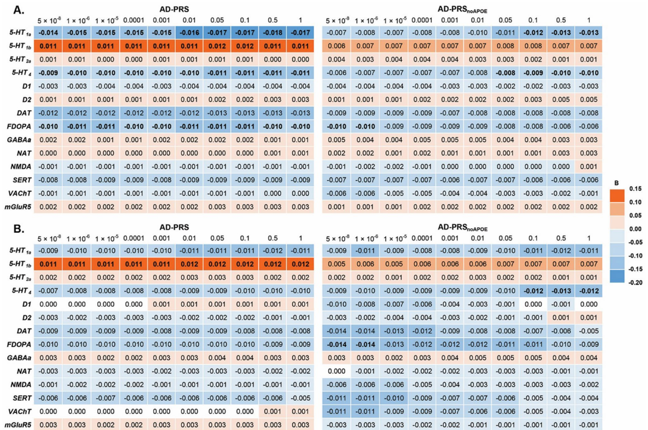
Fig. 3 Associations between both PRSs and GMV-neurotransmitters correlation coefficients A in the whole sample ( n=800 ) and B in the sub-sample of A\beta+ participants ( n=481 ). Significant associations are highlighted in bold

In this study, therefore, serotonin emerges as a potential mediator of GM degeneration due to AD. Alterations in serotonergic neurotransmission and receptor density decreases in temporal areas have been observed in AD in association with behavioural deficits [39]. It is possible that a depletion of serotonergic inputs to the medio-temporal lobe due to AD-induced neuronal death in the raphe nuclei [18] may hinder neurogenesis in the dentate gyrus, a process that seems to be influenced by the activation of multiple serotonergic receptors in mice [40]. Verdurand & Zimmer [41] have highlighted that 5HT_{1a} receptor expression can be modified by A\beta plaque accumulation in early disease stages leading to receptor loss in the hippocampus and, consequently, to hippocampal dysfunction. Moreover, pharmacological stimulation of different serotonin receptors (e.g. 5HT_{1a} , 5HT_4 and 5HT_6 ) seems to have beneficial effects on cognitive performance [42].