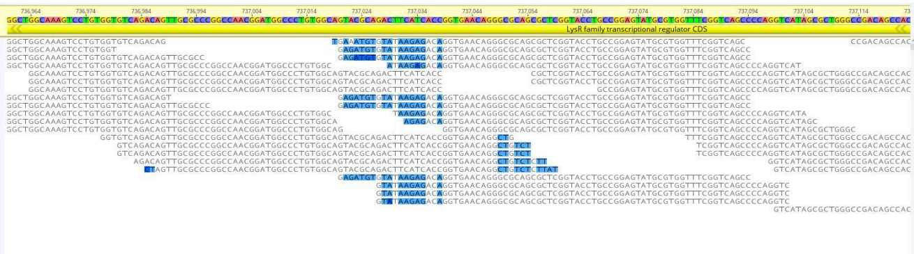
FIGURE S4. Map of RNA sequencing (RNA-Seq) reads for the lysR1 gene in the Erwinia amylovora lysR1 -Tn5 mutant.