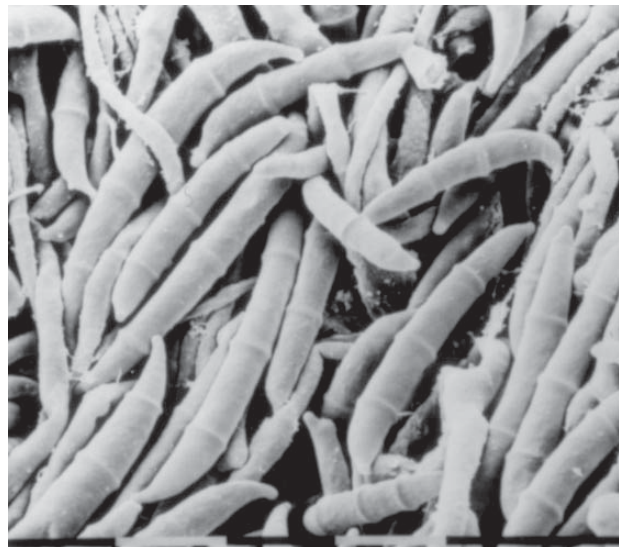
Fig. 2. SEM micrograph of conidia of F. graminearum on potato dextrose agar. Bar = 10 \mu m

with bromuconazole (0.117–0.341 mg kg -1 in OS; 0.098–0.381 mg kg -1 in the CS), prochloraz (0.065–0.401 mg kg -1 in OS; 0.088–0.370 mg kg -1 in the CS) and tebuconazole (0.236–0.316 mg kg -1 in the OS; 0.240–0.372 mg kg -1 in the CS).