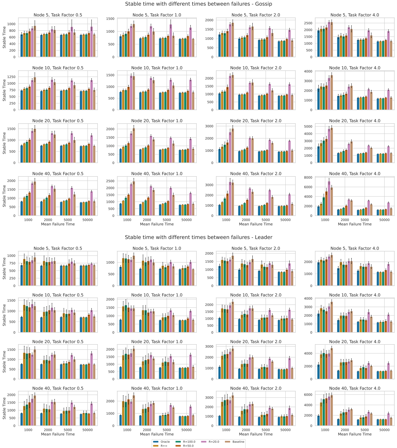
Fig. 2. Mission completion time T_s over mean time between failures \lambda^{-1} For the gossip-based approach (top) and the leader-based approach (bottom). Differently colored bars represent different values of R (the baseline and the oracle ignore R ). Each subplot frames a specific configuration of the robot count m and the task-to-robot ratio n/m . With sufficient communication range ( R \geq 50 m), both field-based methods outperform the baseline and approach Oracle performance. gossip-based offers greater resilience under frequent failures, while leader-based is more efficient but less robust to leader transitions. Thus, gossip-based trades higher overhead for robustness; leader-based trades resilience for efficiency.