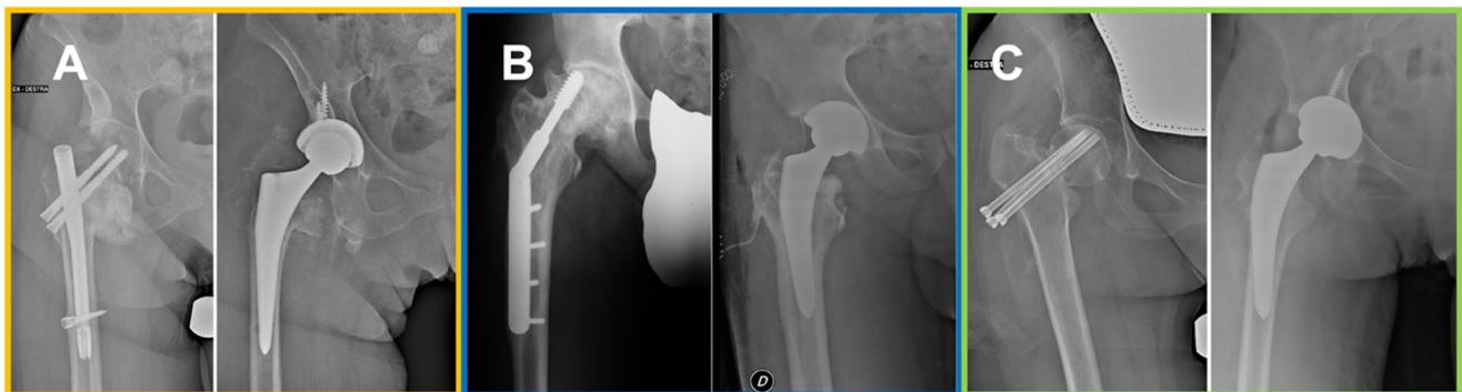
Fig. 1 cTHAs performed after intramedullary nail (A-orange), plate/screw system (B-blue) and cannulated screws (C-green) removal

Additional articles were found through a cross-reference search of eligible studies. Two authors (CD and RP) independently screened all potentially relevant titles and abstracts, and any disagreement was solved by the senior authors (ADM and CF). The Preferred Reporting Items for