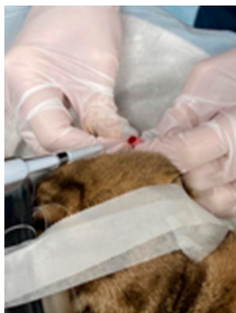
Figure 1. The blood samples were taken by pricking the cat's ear with a needle. A 20 µL volume was collected using a P20 Gilson Pipette and deposited onto Whatman Protein Saver 903 paper.

Dried blood spot samples were left to dry at room temperature, away from heat sources, with care taken to prevent contamination. After the final collection, all samples were allowed to dry for 2 h and then stored in plastic bags at room temperature, protected from light, for up to 24 h before analysis. A representative image of the DBS sampling procedure is shown in Figure 1.