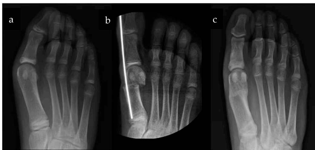
Figure 3. (a) Preoperative, (b) Intraoperative and (c) 12 months postoperative X-rays.