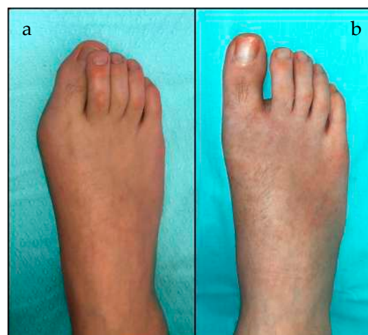
Figure 2. (a) Preoperative and (b) 12 months postoperative clinical documentation.

PROM = Patient Related Outcome Measure; VAS = Visual Analogue Scale; AOFAS = American Orthopaedic Foot and Ankle Score for Hallux Valgus; SD = Standard Deviation.