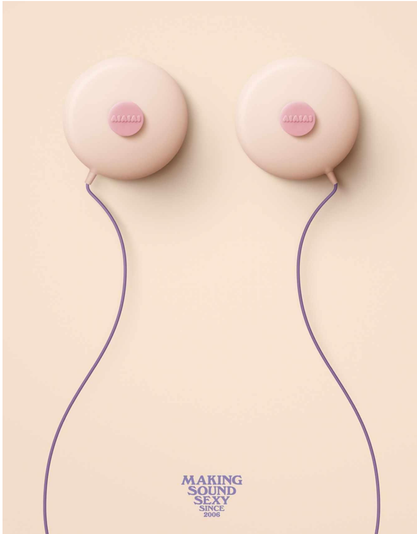
Figure 5. Advertisement for headphones.

Figure 6 advertises Toblerone, the popular chocolate bar with a triangular shape. The image represents a triangle (musical instrument), which recalls the shape of the chocolate bar. Moreover, the slogan ( Music to your mouth ) suggests a cross-domain mapping between the hearing and the taste sensory modality, which are metonymically cued in the image by exploiting the similarity in shape between the chocolate bar and the musical instrument. As already indicated in the analysis of Figure 4, this slogan can also be seen as a variation of the existing expression Music to your ears . In this case, the variation is even simpler than in Figure 4; here, the word ear is simply substituted with mouth . Both words designate body parts, which are tightly related to the sensory modalities of hearing and taste respectively, by means of metonymies. Therefore, the sensory target of the linguistic synaesthesia in Figure 6 is taste ( mouth ), and the source is