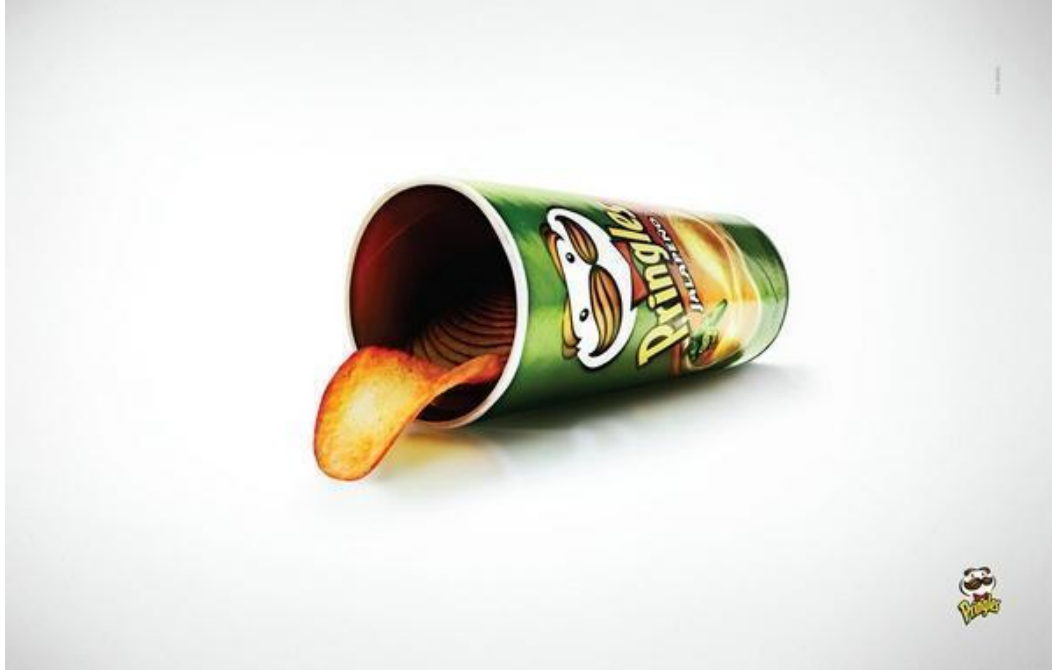
Figure 1. Advertisement for potato chips. Copyright owner: Grey Toronto advertising agency (2008). Retrieved from: https://www.coloribus.com/adsarchive/prints/pringles-tongue-11484605/

In Figure 1, the product to be sold is a potato chip, which in its representation resembles a tongue. We can deduce this analogy from the shape of the potato chip and its position within the container, which in turn resembles an open mouth. In this case, both ‘chip’ and ‘tongue’ point to the same sensory modality, that of taste. Thus, according to our identification strategy, we cannot classify this advertisement as an example of synaesthesia, because in synaesthesia the product and the properties used to advertise it must point to different sensory modalities, while here only one sensory modality is evoked.