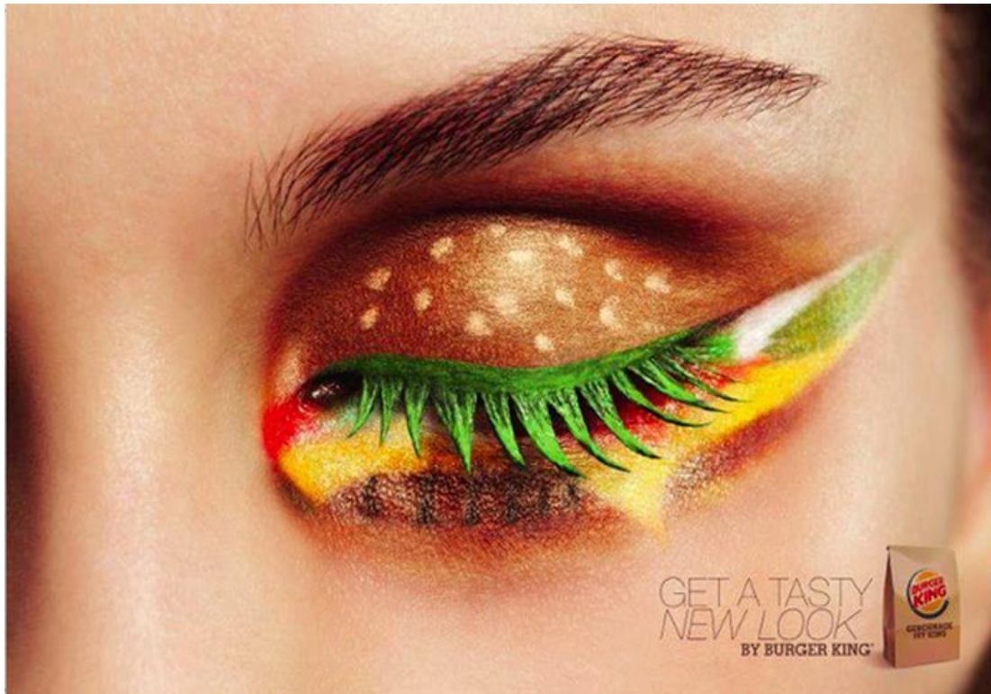
Figure 7. Advertisement for a hamburger.

to sight. In Figure 7, therefore, the image can arguably be interpreted as visual ‘translation’ of the linguistic synaesthesia of the slogan. The latter helps the consumer to disambiguate the image by suggesting the correct identification of source and target modalities: although the advertised product is a hamburger, the sensory target is not its taste, but its (new) visual appearance.