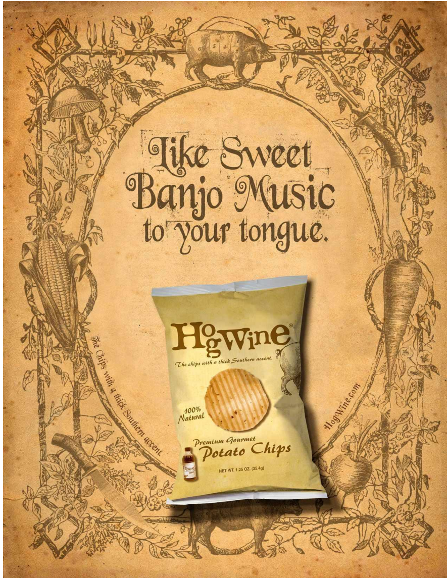
Figure 4. Advertisement for potato chips. Copyright: Sick, Los Angeles, USA (2010). Retrieved from: https://www.adsoftheworld.com/media/print/hogwine_potato_chips_banjo_music