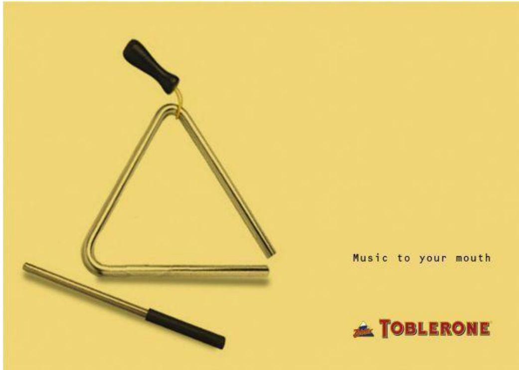
Figure 6. Advertisement for a chocolate bar. Copyright owner: H&C Leo Burnett Beirut advertising agency, Lebanon (2003). Retrieved from: https://www.coloribus.com/adsarchive/prints/toblerone-chocolate-music-5234155/