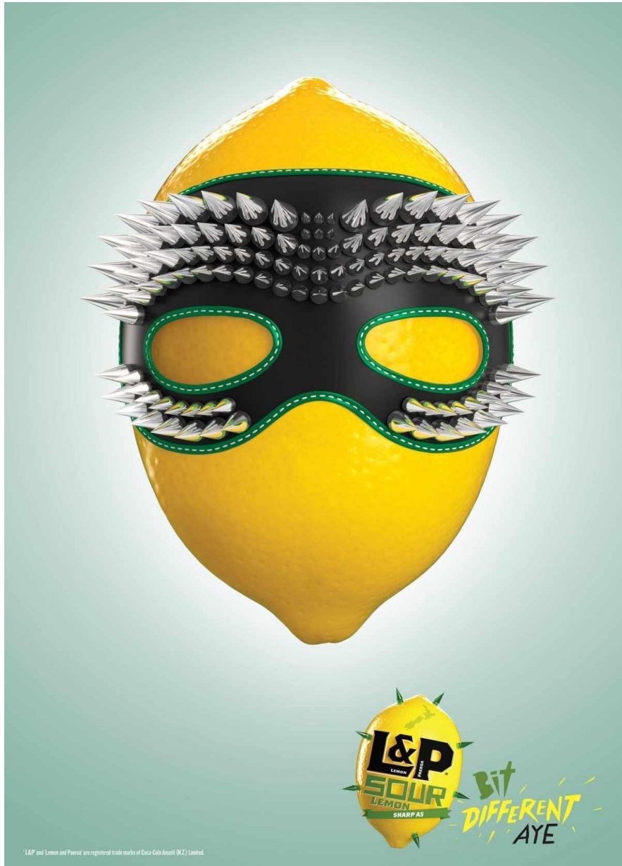
Figure 8. Advertisement for a soft drink. Copyright owner: Saatchi & Saatchi, New Zealand (2013). Retrieved from: https://www.adsoftheworld.com/media/print/lp_sour_mask

then to be viewed as a visual representation of sharp taste , with the concept of ‘sharpness’ conveyed by the pointy studded mask, and that of ‘taste’ represented by the lemon. In addition, it is possible that the brand, L&P, depicted in the same color and style as the mask on the lemon, suggests the name of this type of mask (S&M).