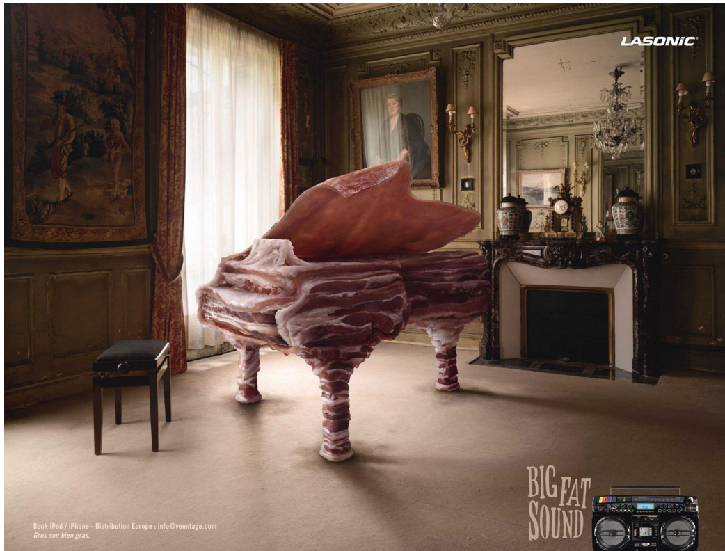
Figure 3. Advertisement for a portable stereo. Copyright owners: Marcel creative agency, Paris, France (2011).

synaesthesia because, although two different sensory modalities are evoked, there is no cross-mapping between them: both food (taste) and music (hearing) are advertised simultaneously.