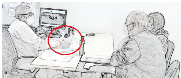
Fig. 1. D places the PET scan report on the table.