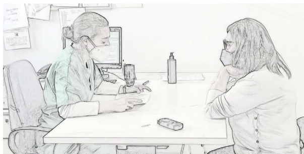
Fig. 4. D looks down at the documents.

*Since the subject of the sentence (i.e., Doctor Cirri) is postponed (see line 11), we added the personal subject pronoun “she” in the gloss to make the transcript understandable to readers who do not speak Italian.