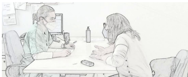
Fig. 5. P leans forward and opens her hands showing puzzlement.