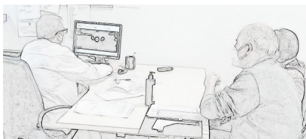
Fig. 2. D turns toward the computer screen.