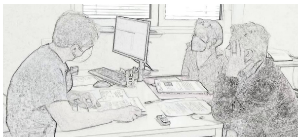
Fig. 7. D looks down at the documents.