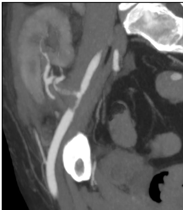
Fig 1. Preoperative computed tomography angiogram showing partial thrombosis of the right external iliac artery and transplant renal artery.

creatinine of 3.6 mg/dL, eGFR of 19 mL/min, and preserved diuresis (chronic kidney disease stage 4), without the necessity for dialysis. Hemodialysis was performed only before and after the use of iodine contrast medium to prevent a worsening of his renal function.