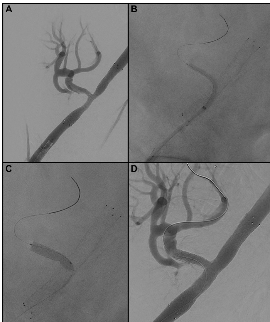
Fig 3. Stenting procedure. A , Angiogram showing right external iliac artery stenting. B , Angiogram showing predilation of transplant renal artery. C , Angiogram showing transplant renal artery stenting. D , Postoperative angiogram.

Vascular complications after renal transplantation are the most critical complications with a very high risk of graft loss. Of these, RAT is the most significant, although rare, with a reported incidence of \leq 4\% , and can lead to sudden graft loss. 6,13,14 As Bakir et al 15 highlighted in their study, there are five independent risk factors for RAT, including the use of the donor's right kidney, a history of venous thrombosis in the recipient, problems with the surgical technique, diabetic nephropathy, and the perioperative hemodynamic status of the recipient. 15 In our clinical case, specifically, this mid-term complication of RAT can be ascribed