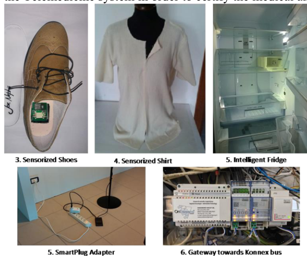
Figure 2. Example of HicMO SOs prototypes

About security aspects, the platform allows to recognize the specific user (thanks to the HicMO Tracker) who is executing a specific action. As a consequence, data about that user are referred to the user and manage securely. A specific security protocol is then implemented by the Telemedicine system in order to certify the medical and vital data.