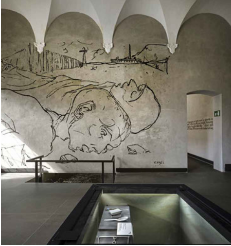
Figure 28 BBPR, Museum-Monument to Political and Racial Deportees, Carpi, 1963-1973

conflict, making the history of most memorial architecture dedicated to Deportation particularly tormented. This happens not only because of the obvious political sensitivity of the area, but also because they are projects that directly deal with a fracture created in the discipline also and above all following the experience they recall, a fracture that the dominant historiography in the field of architecture has mostly neglected in favour of a narrative on the continuity and revision of the Modern Movement, but that in fact radically redefines the tasks of architecture in the second half of the 20 th century.