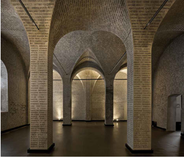
Figure 23 Museo Monumento Carpi

visible impossibility of drawing on the symbol, on the full, positive figure, begins again with the great “tombstone” of the Ardeatine, a real gap in the rich figurative and panoramic narrative of that project, and – after haveutralizatioised much of the production on the subject – certainly achieves its expressive and effective acme in the Memorial to the Murdered Jews of Europe (Berlin 1998) by Peter Eisenman.