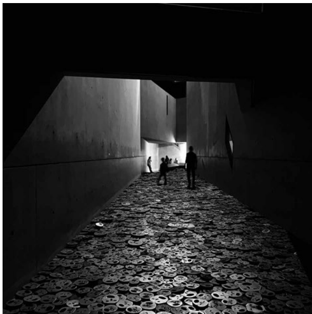
Figure 26 D. Libeskind, The Jewish Museum, Berlin, 1989-2001