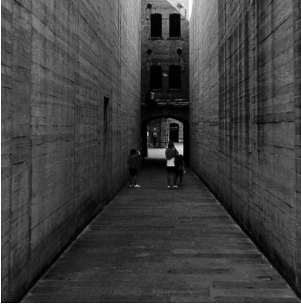
Figure 25 R. Boico, San Sabba Rice Mill National Monument and Museum, Trieste, 1975

dimension is expressed in an interrogative form such as the Memorial of the Shoah in Bologna (SET Architects, 2016) or the UK Holocaust Memorial & Learning Centre (Adjaye Associates and Ron Arad, London, 2021). The disruptive effect of a conception of monumental architecture understood in an interrogative form – somehow a paradox, it has been said – could then be followed throughout the architectural production of the late 20 th century, even non-memorial, marking a profound change in sensitivity.