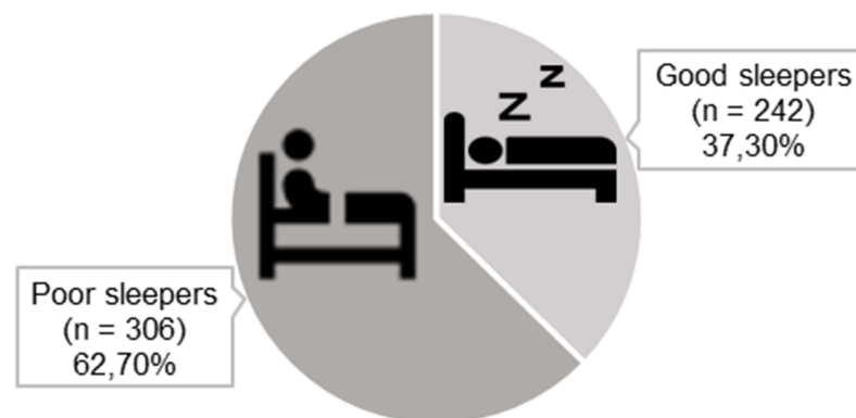
Figure 2 Percentages of poor sleepers and good sleepers during the T1 and the T2 assessments.

Notes: A Sleep Index II score >25.8 was categorized as Poor sleeper; A Sleep Index II score <25.8 was categorized as Good sleeper. The icons are selected from the https://icons8.com/icon/105962/subire-l'insonnia and https://icons8.com/icon/10787/dormire-nel-letto .