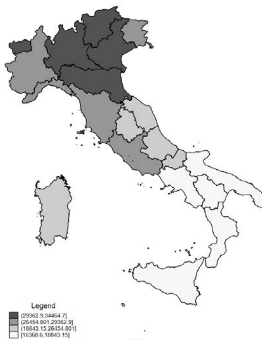
Figure 3b: Income per capita by Region

NOTE: The Figure reports the income per capita by region. Regions with darker color are those where the income per capita is higher.