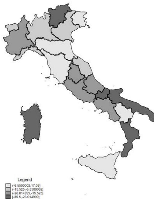
Figure 3a: Difference in Financial Literacy Score between girls and boys.

NOTE: The Figure reports the financial literacy gap between girls and boys by Region. Regions with darker color are those where the financial literacy gap between boys and girls is higher.