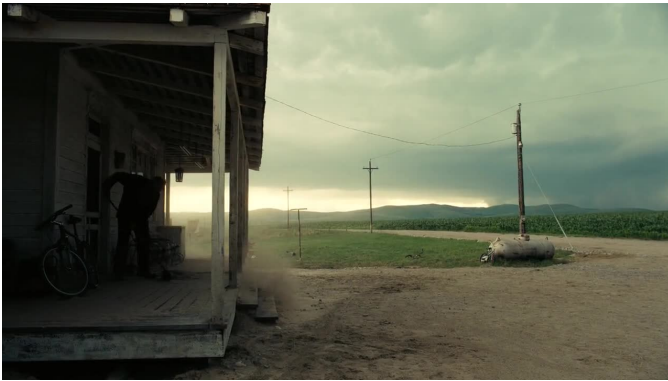
Fig. 2. The frame retrieved for the sentence "A dusty farm under a fading sky." from the movie Interstellar