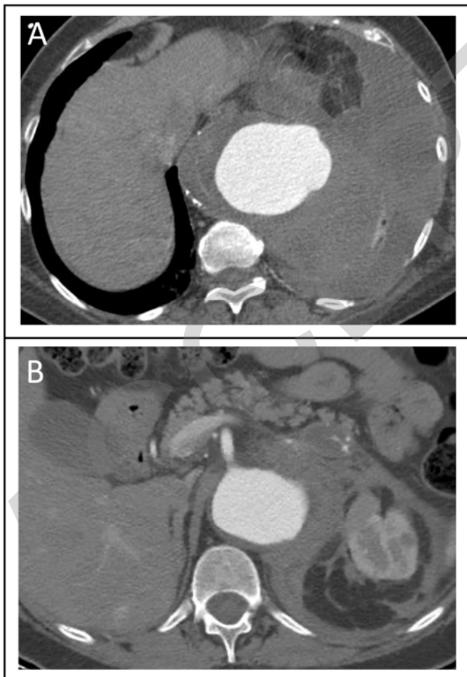
Figure 1B: Contained rupture at the level of the renal and mesenteric arteries in a IV type rTAAA, with total loss of the integrity of the suprarenal right aortic wall, without clear evidence of bleeding but with periaortic structures hematoma.

Figure 1A: Free rupture at the level of the thoracic aorta, with evidence of bleeding outside the aortic wall and in this specific case with left haemothorax and complete lung atelectasis.