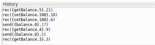
Figure 4. History after roll receive of message 22

and 26 are concurrent and can arrive in any order, which is the bug we were looking for. This can also have been checked by observing that we can replay the release of mutual exclusion (by sending the correspondent message and having meManager receive it) without the need to replay the receive of the setBalance . This shows another advantage of causal-consistent reversibility (w.r.t. mainstream reversible debuggers which linearise the execution): it keeps and uses causality information which can highlight missing synchronisations, like in this case, or undesired dependencies.